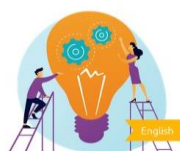
Module 3: Introduction to the design thinking