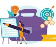
Module 8: How to handle the organizational aspects of a...