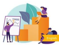
Module 5: Developing a social enterprise business plan