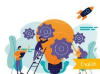
Module 1: Introduction to Social Entrepreneurship and Social...

The heart of our initiative, the pilot program, has been a beacon of innovation, engaging students with interactive learning methodologies that transcend traditional boundaries. By weaving the fabric of social entrepreneurship into the educational experience, we're not just teaching; we're inspiring. Our approach, characterized by the integration of interactive mini-games and the Virtual Social Enterprise platform, has been met with enthusiasm and curiosity, paving the way for a more profound educational impact.