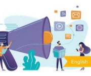
Module 7: Communicating your social enterprise