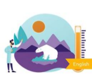
Module 2: Environmental and Climate Change Challenges