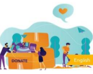
Module 6: Measuring social impact