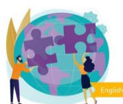
Module 4: Application of social innovation and foundation of a...